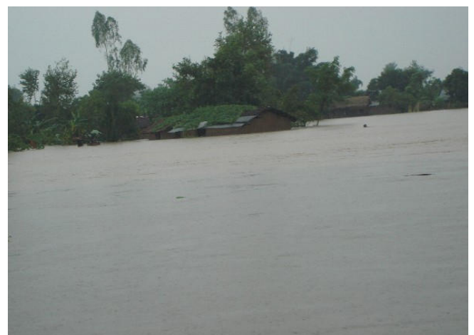
Floods in Geta VDC, Kailali: Source World Vision

On 22 September, the Home Ministry requested OCHA to support the government coordination efforts at the District and regional levels through participation in the DDRC meetings.